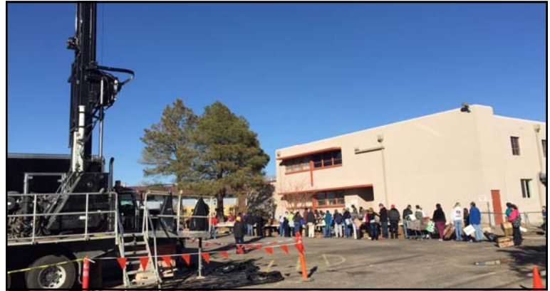
Project personnel from the Air Force, CB&I and CB&I's subcontractor assisted the Christ United Methodist Church with their food drive.

April 23, 2016: Field Trip of Fuel Project Area, Kirtland Air Force Base. For more information or to sign up for the tour, please contact the Air Force or NMED as indicated on page 2.